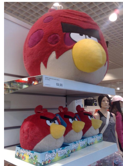
Figure 3. Angry Birds soft toys.

At the moment, merchandising is rare at browser-based games. However, there is a potential for this kind of activity. Good examples from other type of games can be found. For example, characters from very successful mobile game Angry Birds [3] by Finnish video game developer Rovio Entertainment [17] has been commercialized extremely well. There are soft toys, clothes, shoes, calendars, birthday cards, etc. There is also upcoming animation series from Angry Birds. Figures 3 and 4 show different kinds of Angry Birds merchandise products.