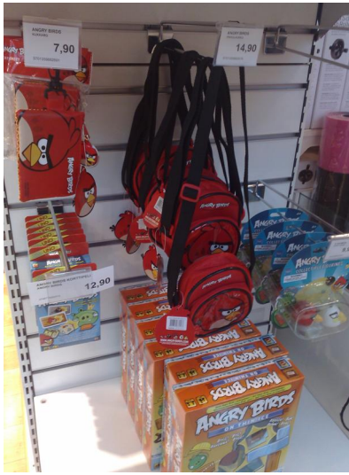
Figure 4. Angry Birds merchandise products.

Merchandising can also be long-term strategy. Usually the games itself must be popular to make the merchandising strategy successful. However, Rovio aim is to make Angry Birds trademark so popular that it can live its own life and success independently from the games [20]. Rovio plans also to release new character sets based on their new games.